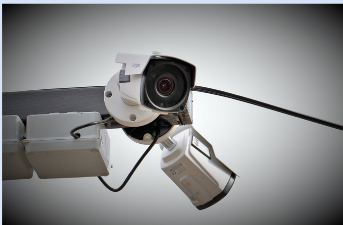
CCTV INSTALLATION AND REPAIR WORKS

Quantum Electrical Solutions have been successfully operating in Pretoria, Centurion and Midrand for over ten years. Over the years the business has developed significantly with lots of procedural and technological advancements but one thing that has remained constant is our determination to achieve the highest possible levels of customer service at all times.